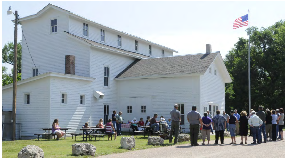
The ownership of Champion Mill State Historical Park and State Recreation Area changed hands July 1. Nebraska Game & Parks Commission formally handed the area over to the Chase County Commissioners during a ceremony Monday.

Official County Newspaper Single Copy: $1.00